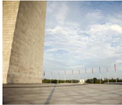
Al Shofa Water Facility